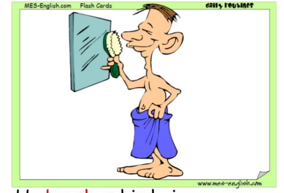
He brushes his hair