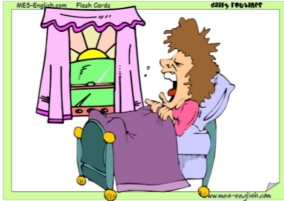
She wakes up