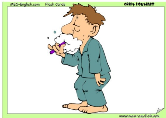
He brushes his teeth