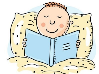
read a book