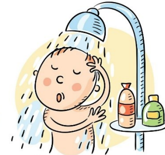
have a shower