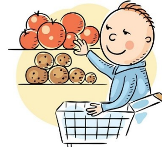
do the shopping