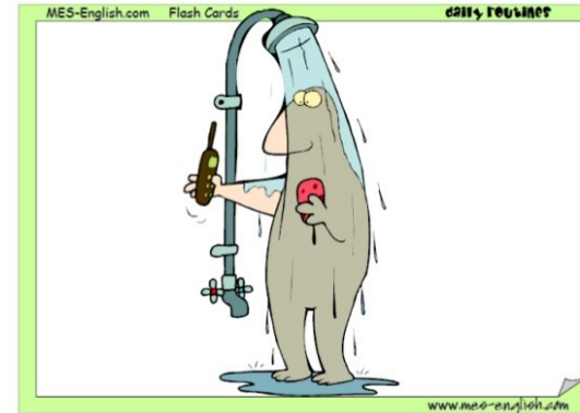
He takes a shower