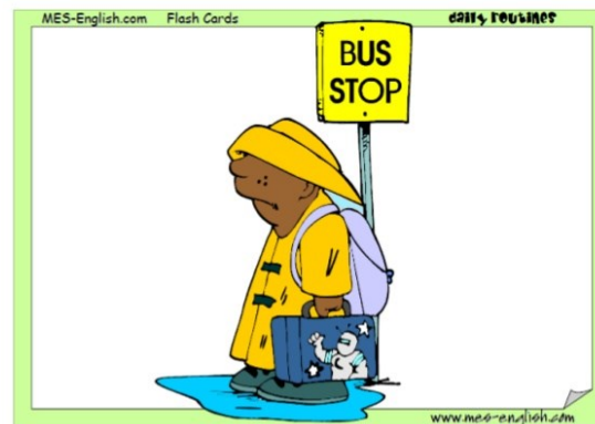
He goes to school