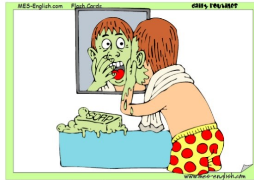
He washes his face