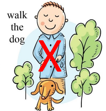
walk the dog